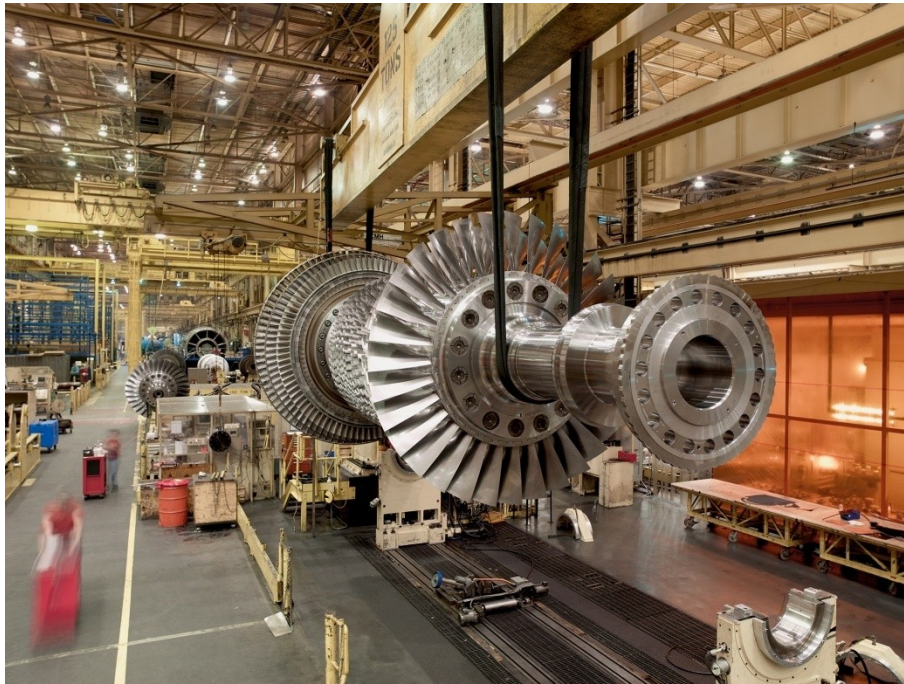
Figure 1: Gas Turbine Assembly

In simplistic terms, a gas turbine produces power by compressing air mixed with burning fuel that is expanded through spinning turbine blades to drive a generator and convert the spinning energy into electricity. Gas turbines range in size from very small units to larger combined cycle generators capable of generating up to 300 MW of power by utilizing advanced materials and technologies. In order to produce such high power levels, much higher turbine inlet temperatures and corresponding cooling systems are required. As a result, sophisticated data acquisition systems are needed in order to ensure the behavior of the turbine at such extreme temperatures.