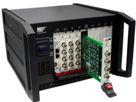
9-Slot 3U PXle High Performance Rugged Chassis, up to 8 GB/s Bandwidth

The system was quite large and since the control room is located at a substantial distance from the test article, it was constructed using large runs of sensor cabling which complicated maintenance and part replacement.