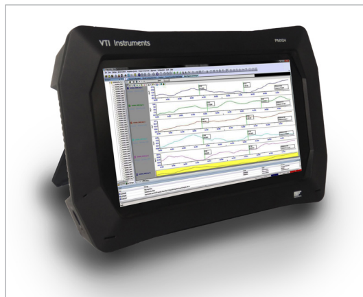
PMX04 PORTABLE 4-SLOT PXIE 'TABLET'

The PMX04 Portable 4-Slot PXIe 'Tablet' installed with EMX-4250's further improved ease of use and portability, as it provided the test engineers with a mobile test system that they could carry to any point near the aircraft and quickly set up and acquire data on the spot.